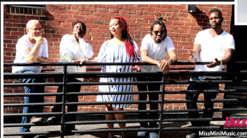
MISS MINI & THE SANDMAN BAND